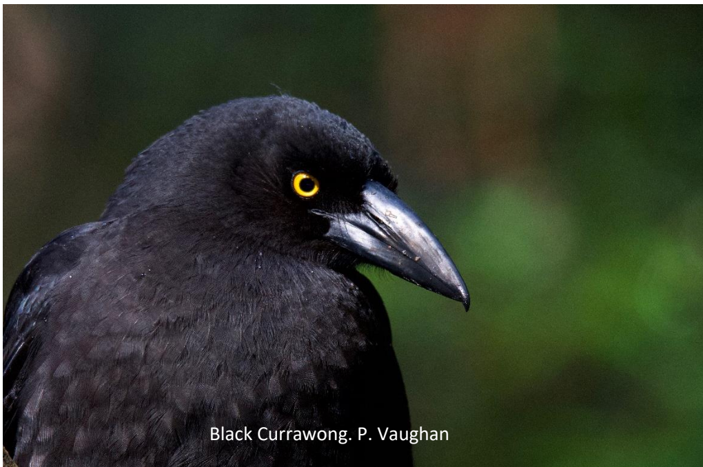
Black Currawong.

This tour has been designed to adjoin the Tasmanian Endemic birds and mammals tour 29 th Jan – 7 th Feb 2022