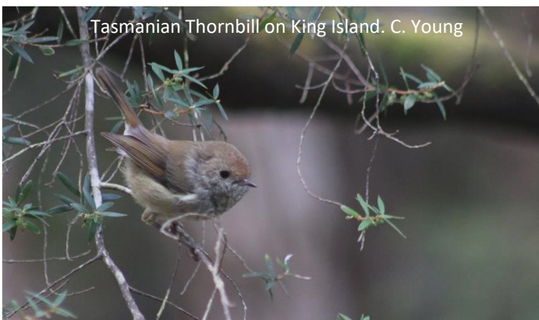
Tasmanian Thornbill on King Island. C. Young

Inclusions: 3 nights en suite accommodation, specialist guiding and land transport on King Island for day and night tours as outlined above including airport transfers, all meals and activities as outlined in the itinerary. Also includes entry fees and GST.