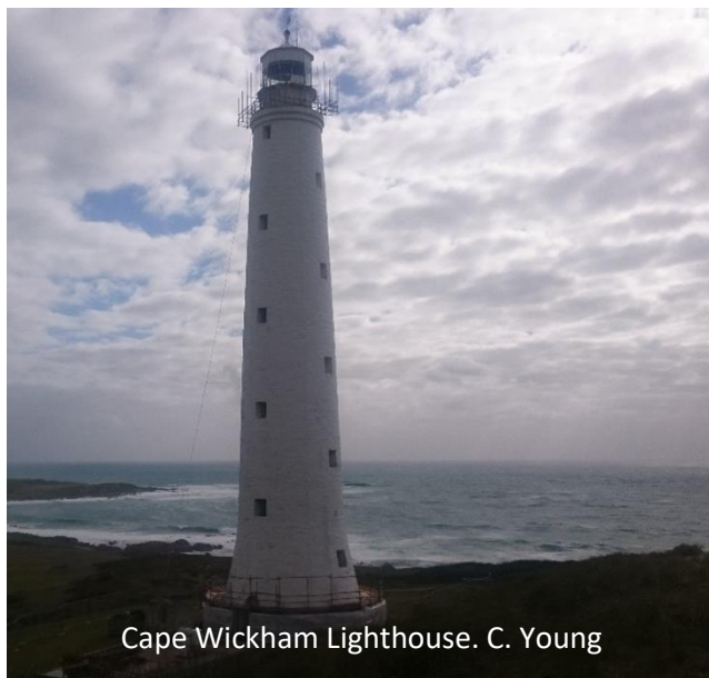
Cape Wickham Lighthouse. C. Young

Please note: Whilst we aim to follow the itinerary as planned, please note that the itinerary provided should only be used as a guideline. Depending on individual trip circumstances, weather, and local information, the exact itinerary may not be strictly adhered to. The guides reserve the right to make changes to the itinerary as they see fit.