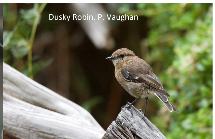
Dusky Robin. P. Vaughan

Exclusions: Airfares, activities and meals not mentioned above, alcoholic beverages and expenses of a personal nature (snacks, travel insurance, internet, laundry, tips etc).