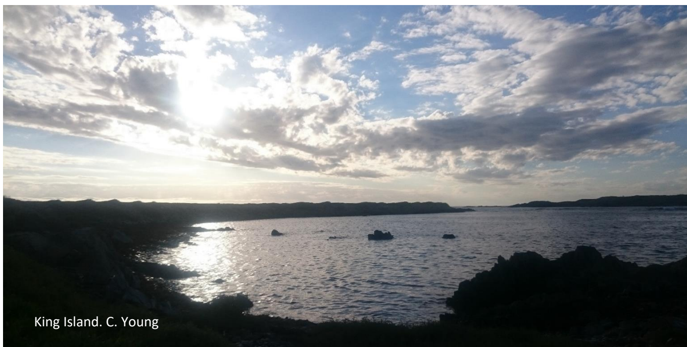
King Island. C. Young