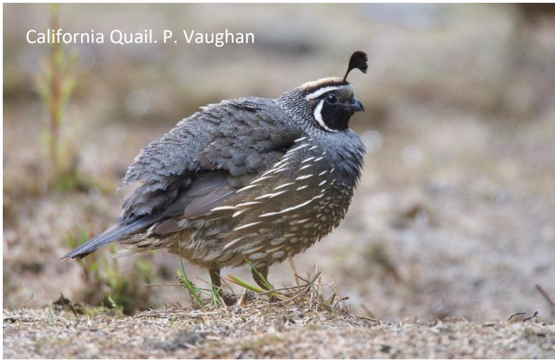
California Quail. P. Vaughan

Day 4. Thu 10 th Feb 2022 For our final day on the island, we will head north, visit some key birdwatching sites such as Lavinia State reserve, and visiting some of King Islands most famous sights. At the impressive