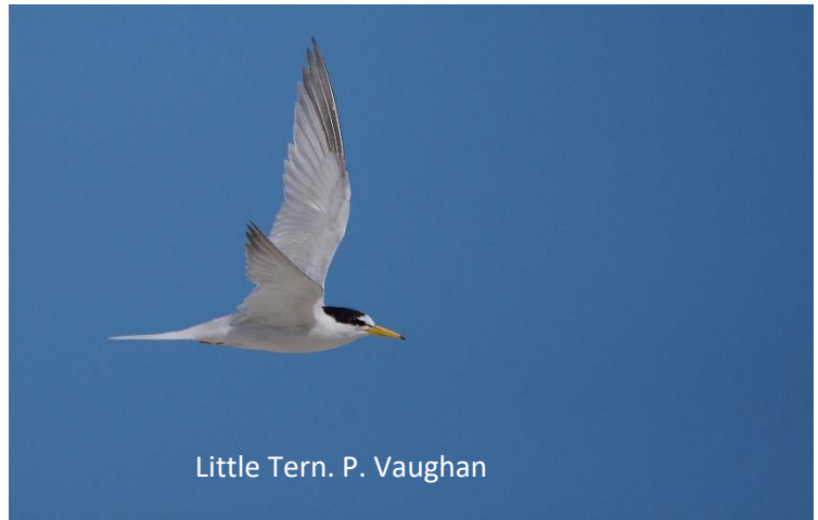
Little Tern.

Day 3. Wed 9 th Feb 2022 Today we will continue to explore the southern half of the island as this is where we will see most of our target bird species. We will spend time walking and driving through Pagarah State Forest and Sea Elephant Conservation Area. Pagarah contains some of the oldest forest on the island and is home to the critically endangered King Island subspecies of the Brown Thornbill and Scrubtit. While the