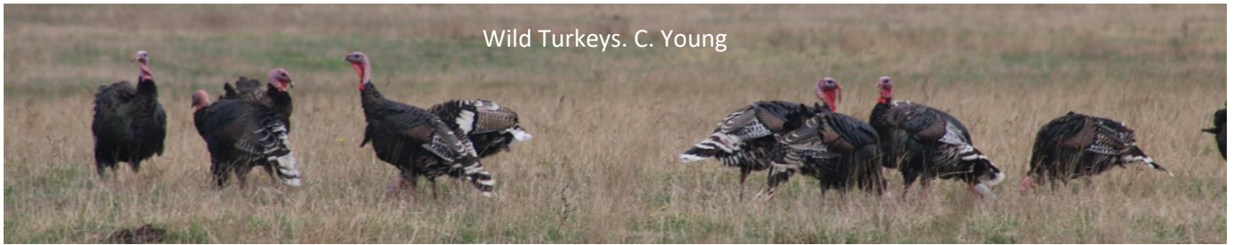
Wild Turkeys. C. Young

Day 4. Thu 10 th Feb 2022 For our final day on the island, we will head north, visit some key birdwatching sites such as Lavinia State reserve, and visiting some of King Islands most famous sights. At the impressive