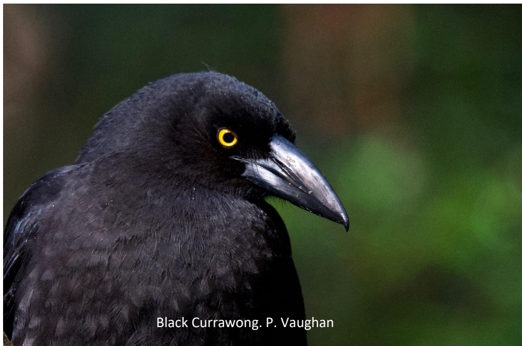
Black Currawong.

This tour has been designed to adjoin the Tasmanian Endemic birds and mammals tour Sat 20 to Mon 29 November 2021