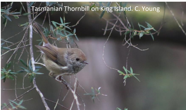
Tasmanian Thornbill on King Island. C. Young

Inclusions: 3 nights en suite accommodation, specialist guiding and land transport on King Island for day and night tours as outlined above including airport transfers, all meals and activities as outlined in the itinerary. Also includes entry fees and GST.