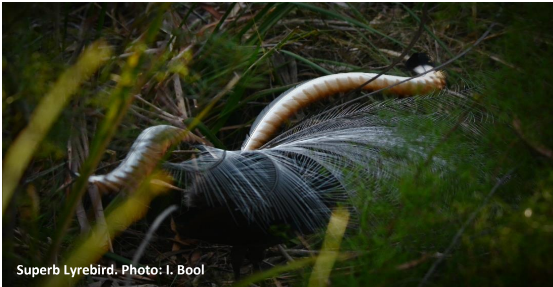
Superb Lyrebird.

With a wide variety of habitats on the city's doorstep, this six-day tour of the Sydney area takes in the best of the region's wildlife, from an abundance of birdlife through to various amazing mammals and reptiles. We visit the beautiful Royal National Park, the vast Blue Mountains National Park, the incomparable Capertee Valley and the heathlands, forest and open ocean of the Illawarra region. Star attractions are Superb Lyrebird, Glossy Black-Cockatoo, Eastern Bristlebird, Southern Emu-wren, Gang-gang Cockatoo and the NSW endemic Rock Warbler. We also include a night tour to see nocturnal mammals such as Greater and Sugar Gliders, and, if weather permits, a boat trip to look for albatross and other seabirds close to the continental shelf. This tour has been designed to join our South East Queensland group tour (7-16 Nov 24) and our South East Australia tour (23 Nov - 2 Dec 24)