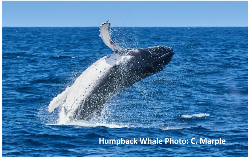
Humpback Whale

Another early morning will see us down on the docks at the coastal town of Kiama, ready to board our charter for the day as we head out to the continental shelf in order to see a variety of pelagic seabirds. Species we will look for include Shy, Campbell & Buller's Albatross, Grey-faced Petrel, Providence Petrel, Fairy Prion, Pomarine Jaeger, White-faced & Wilson's Storm-Petrels, Australasian Gannet and hopefully Wandering Albatross. At this time of year we will have an excellent chance of seeing migrating Humpback Whales, with some individuals often approaching the boat quite closely. Other mammals include the chance of Common & Bottlenose Dolphins, Short-finned Pilot Whale and New Zealand Fur Seal. We usually arrive back to shore mid-afternoon so if we're up for it we can do some local birding or just have the rest of the afternoon off to relax.