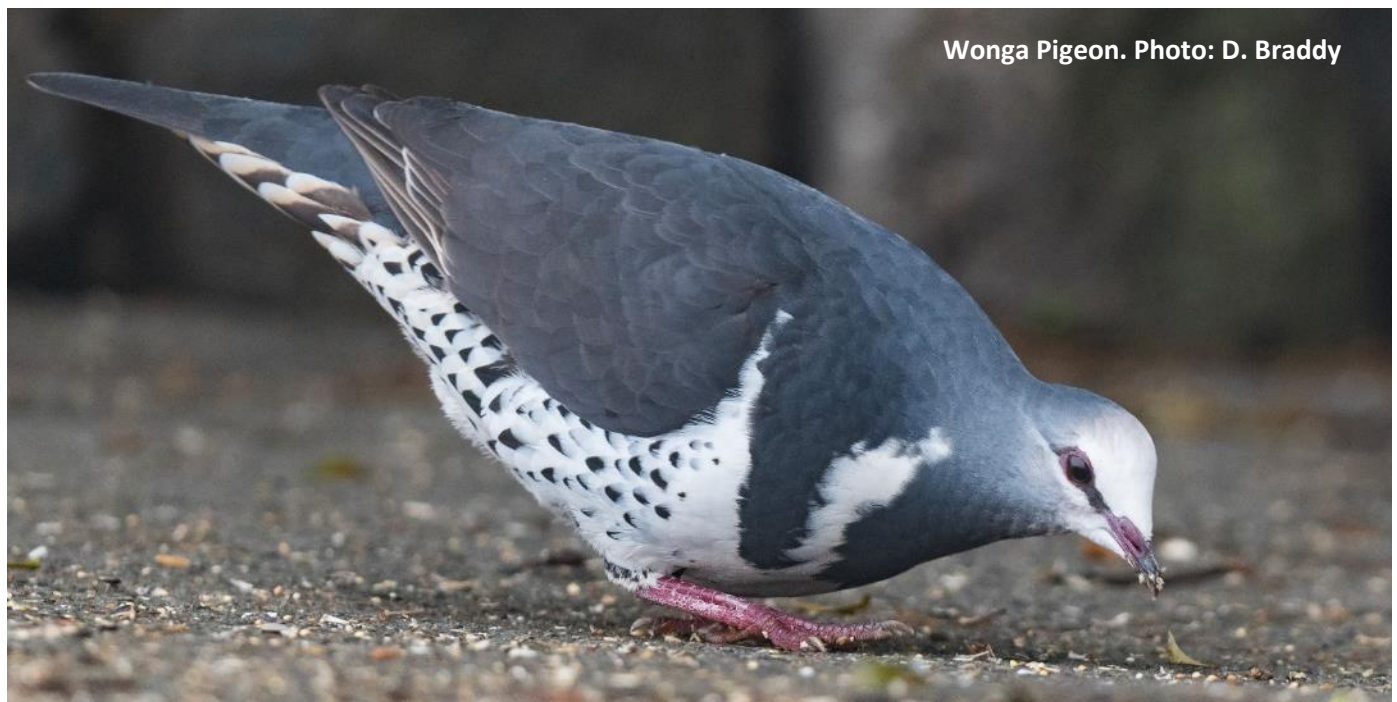
Wonga Pigeon.

Accommodation: none. Meals included: B, L.