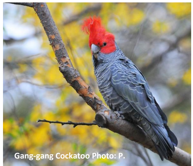
Gang-gang Cockatoo