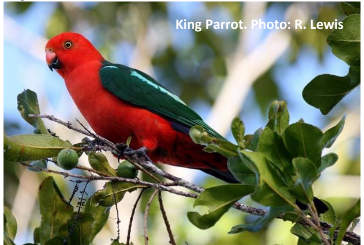
King Parrot.

Accommodation: Jamberoo (en suite rooms) as for last night. Meals included: B, L, D.