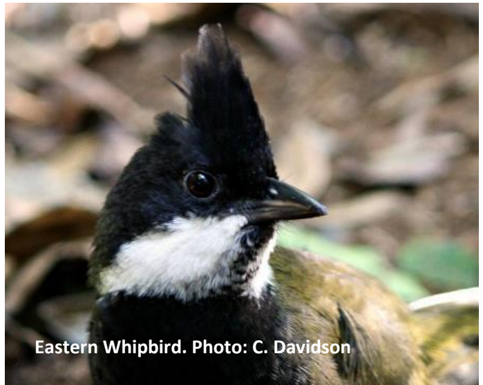
Eastern Whipbird.

After a more leisurely breakfast this morning we will leave the Illawarra and make our way towards the Blue Mountains, necessitating a few hours of travel in the morning. Birding en route we hope to find Bell Miner, Sulphur-crested Cockatoo, Grey Butcherbird and Australian Hobby. In the afternoon we will concentrate our efforts on finding the enigmatic Rock Warbler amongst the tumbled and craggy sandstone outcrops of the Blue Mountains National Park. Other birds in the mountainous forests here can include Red-browed Treecreeper, Eastern Whipbird, Rose Robin, Common Koel and White-browed Scrubwren. If the sun is shining, we may find reptiles like Diamond Python or Jacky Dragon. We will then make our way to our base at Lithgow late afternoon.