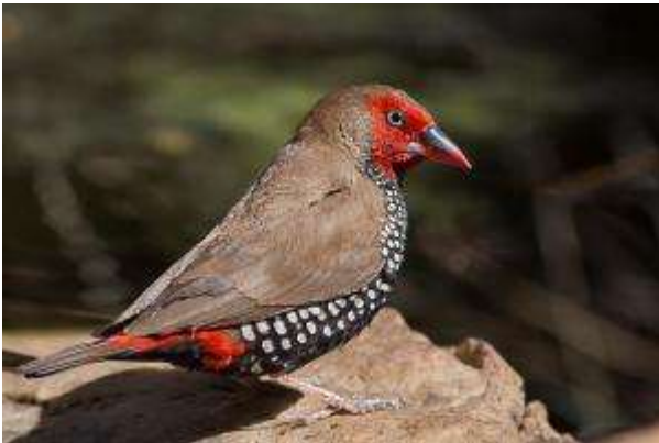
Painted Finch - Andrew Browne

Accommodation: Mount Isa (en suite rooms). Meals included: B, L, D.