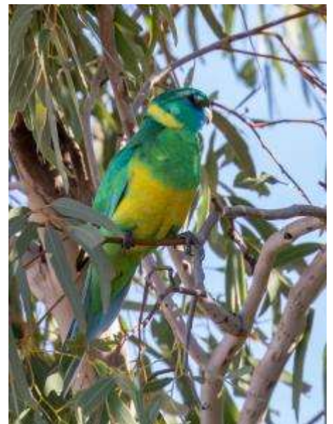
Cloncurry Ringneck Alfred Schulte

Accommodation: Winton (en suite rooms). Meals included: B, L, D.