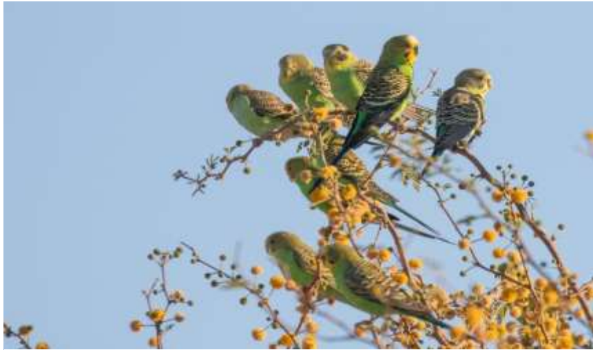
Budgerigars - Alfred Schulte

Click here for a separate online doc that answers many of the frequently asked questions about Small Group Tours