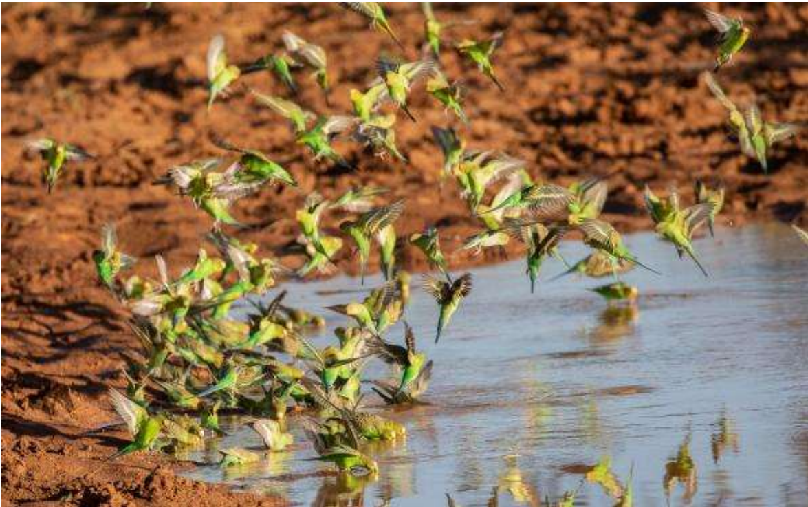
Alfred Schulte - Budgerigars

Itinerary prepared by Tonia Cochran, Inala Nature Tours, September 2022