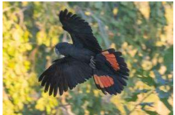
Red-tailed Black Cockatoo - Karen Dick