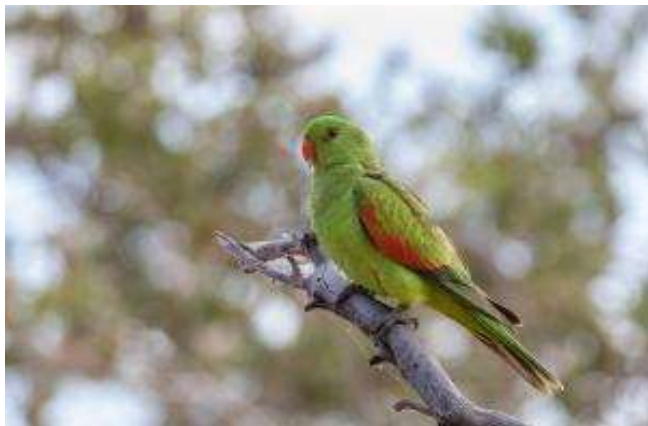
Red-winged Parrot - Alfred Schulte

Accommodation: near Boodjamulla National Park (en suite cabins). Meals included: B, L, D.