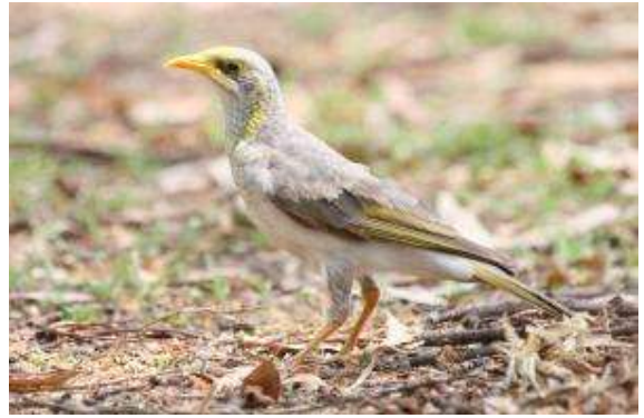
Yellow-throated Miner - Bob Lewis

Accommodation: Cairns (en suite rooms). Meals included: B L D.