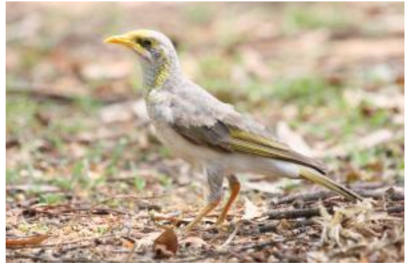
Yellow-throated Miner - Bob Lewis

Accommodation: Cairns (en suite rooms). Meals included: B L D.