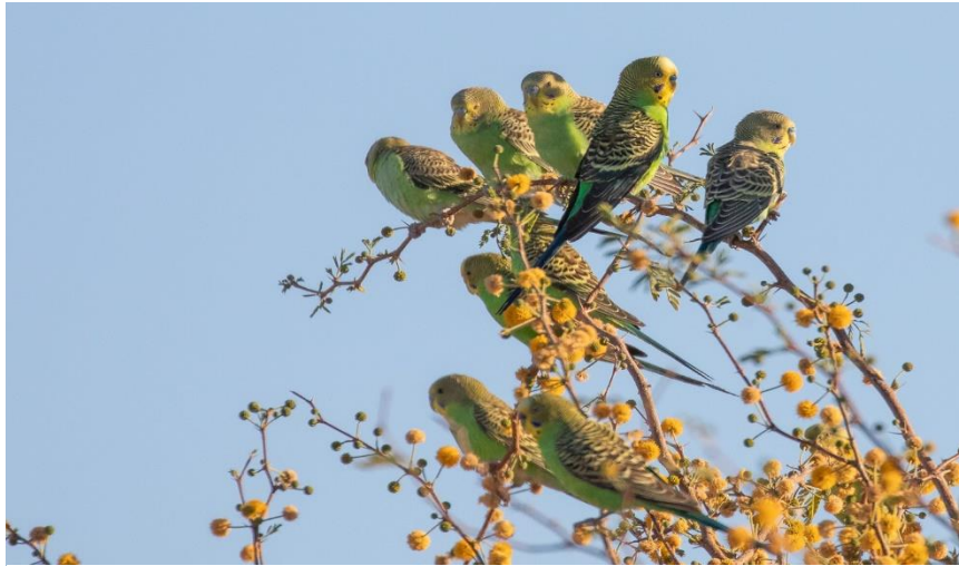
Budgerigars - Alfred Schulte

Click here for a separate online doc that answers many of the frequently asked questions about Small Group Tours