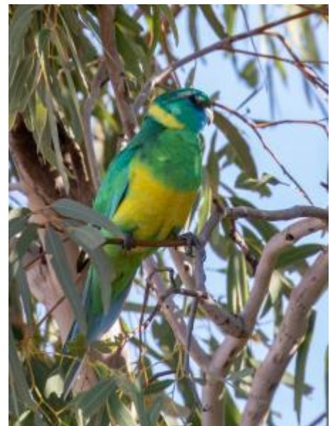
Cloncurry Ringneck Alfred Schulte

Accommodation: Winton (en suite rooms). Meals included: B, L, D.