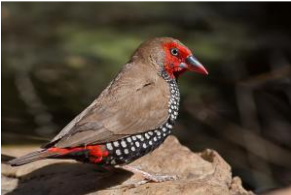
Painted Finch - Andrew Browne

Accommodation: Mount Isa (en suite rooms). Meals included: B, L, D.