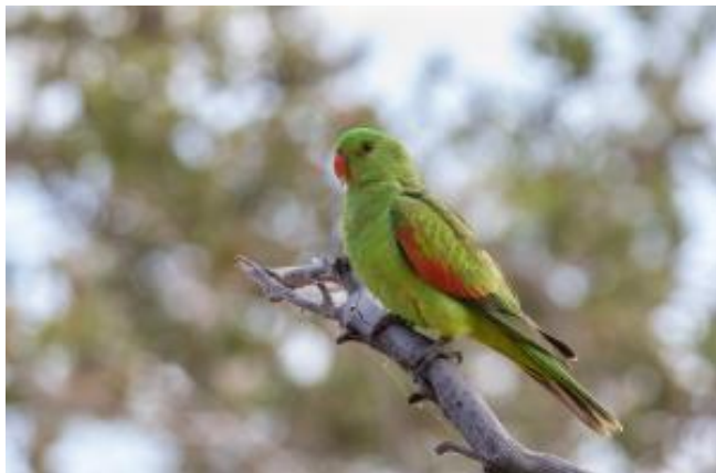
Red-winged Parrot - Alfred Schulte

Accommodation: near Boodjamulla National Park (en suite cabins). Meals included: B, L, D.