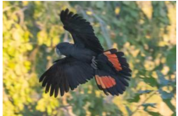
Red-tailed Black Cockatoo - Karen Dick