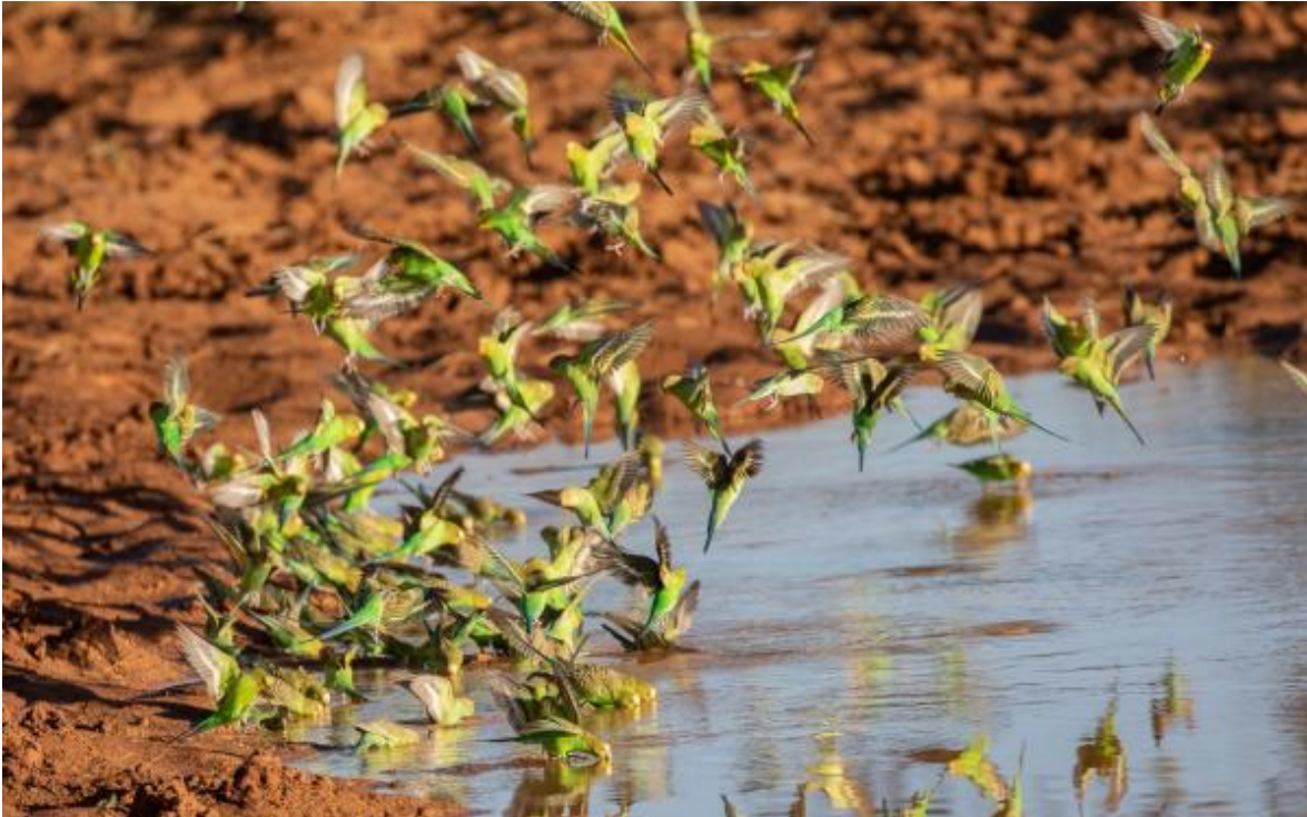
Alfred Schulte - Budgerigars

Itinerary prepared by Tonia Cochran, Inala Nature Tours, September 2022