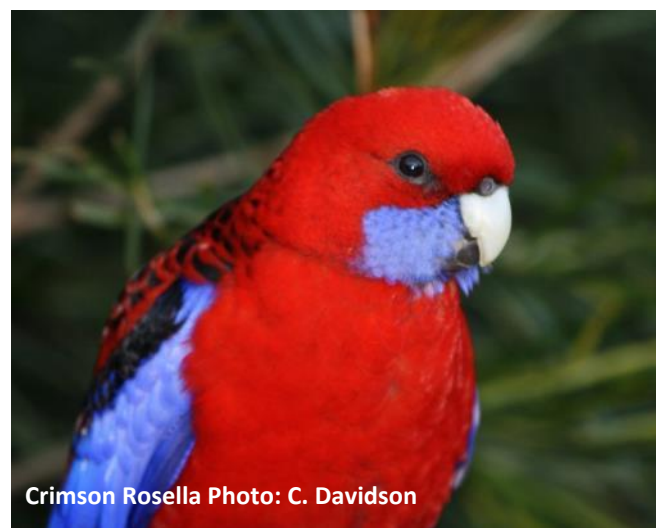
Crimson Rosella