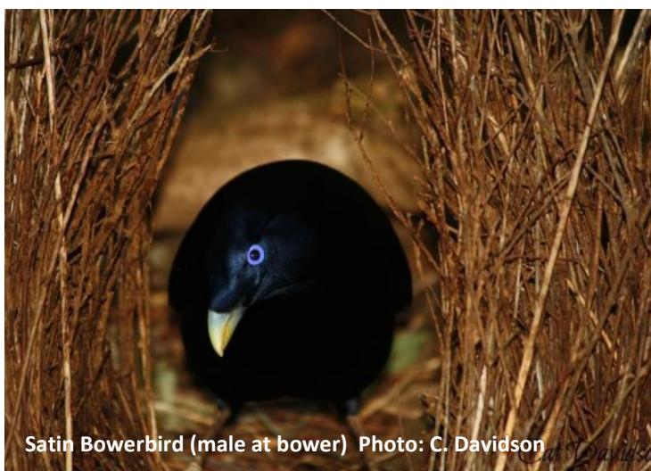
Satin Bowerbird (male at bower)

Day 4. Saturday 26 November 2022. Lamington National Park) to Warwick via Main Range NP. This morning we will leave O'Reilly's after another look around for anything we have missed so far, and head to Main Range National Park (around 3 hours drive). This 348km 2 the park encompasses mountains, scenic views, and a diverse array of walks, all within the Gondwanan Rainforest of Australia World Heritage Area. A diversity of habitat types within the park, which includes subtropical and cool temperate rainforest, wet and dry sclerophyll forest, and montane heath, provides the opportunity to encounter any of the 50 reptiles and 30 amphibians that occur within the park. We will take one of the shorter walks here looking for a range of species, before heading to Warwick to drop our bags, have lunch and a break. This afternoon we will head to Goomburra for some afternoon birding along the creeks and around the campground. We will also take another night tour to see nocturnal creatures. Target species today include Blackish Blind Snake, Carpet Python, Dwarf