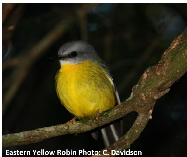
Eastern Yellow Robin

Day 3. Friday 25 November 2022. Lamington National Park. Today we have a full day to explore the areas further from the lodge, particularly targeting tracks that cross streams in search of reptiles of the genera Saproscincus , Eulamprus , Karria , Coeranoscincus and if not previously found, Southern Angle-headed Dragons. There are plenty more birds to see, including Albert's Lyrebird, Yellow-throated Scrubwren, Eastern Whipbird, Wompoo, Wonga, Topknot and White-headed Pigeon, Rose Robin and the stunning Noisy Pitta. We should also see Red-legged Pademelon in the forest. After another early dinner we will spotlight for herps and mammals we missed the previous night. We will also try for the endangered Fleay's Barred Frog.