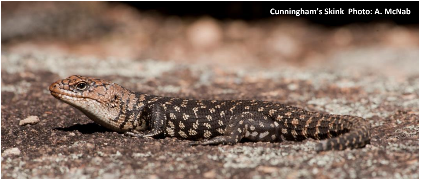
Cunningham's Skink

Day 6. Monday 28 November 2022. Girraween NP. We will spend a second day in the Park today in search of more birds and reptiles. Activities can include a hike up to a viewpoint to see Cunningham's Skinks. This is also a good opportunity to have a rest and explore locally around the accommodation after all these night excursions!