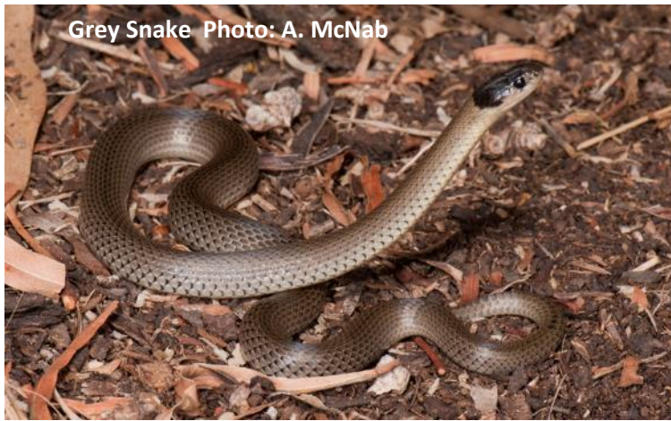
Grey Snake