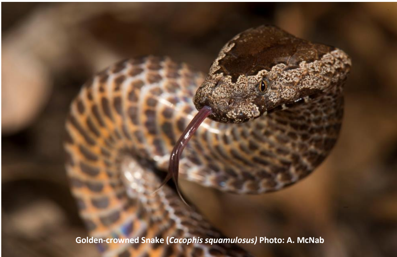
Golden-crowned Snake ( Cacophis squamulosus)

This tour has been designed to link with the Inala NSW Parks Natural history tour (18-23 November 2022) so please contact us if you are interested in joining both.