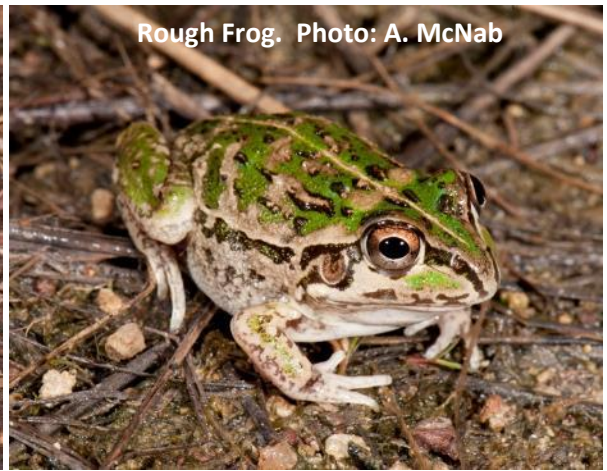
Rough Frog.

Day 8. Wednesday 30 November 2022. Bunya Mountains. In the morning we can try for Condamine Dragons and then drive out to Bunya Mountains. Leaving the Brigalow we'll head to an isolated patch of the South-east Queensland Bioregion in the Bunya Mountains (1.5 hours). We will spend the day walking trails and enjoying the cool mountain areas in search of endemic Bunya Sun Skinks and Tiger Snakes, Swamp and Red-necked Wallaby, and fruit-doves, gerygones, thornbills, catbirds and rainforest species. This area is also one of the last refuges of the Bunya Pine, the last surviving species of the genus Araucaria in the Bunya group (fossils of this group can be found in South America and Europe). This group was diverse and widespread in the Mesozoic Era (particularly 150-200 million years ago). These trees grow to a height of around 45m and produce football-sized cones containing edible kernels which were used as a traditional indigenous food source. After dark we will watch the bats come out of the old buildings in the area and spotlight along some streams for more nocturnal fauna.