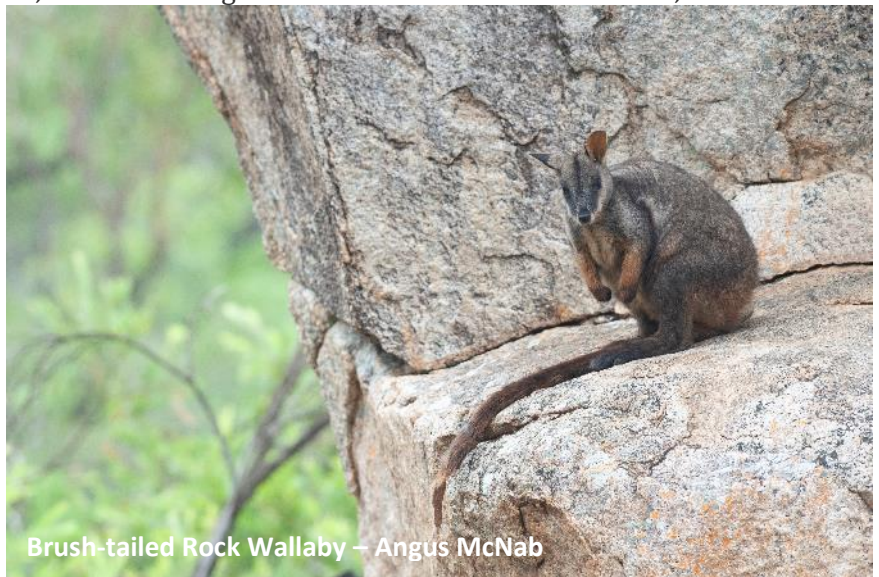
Brush-tailed Rock Wallaby – Angus McNab

Accommodation: Brisbane (en suite rooms). Meals included: B, L, D.