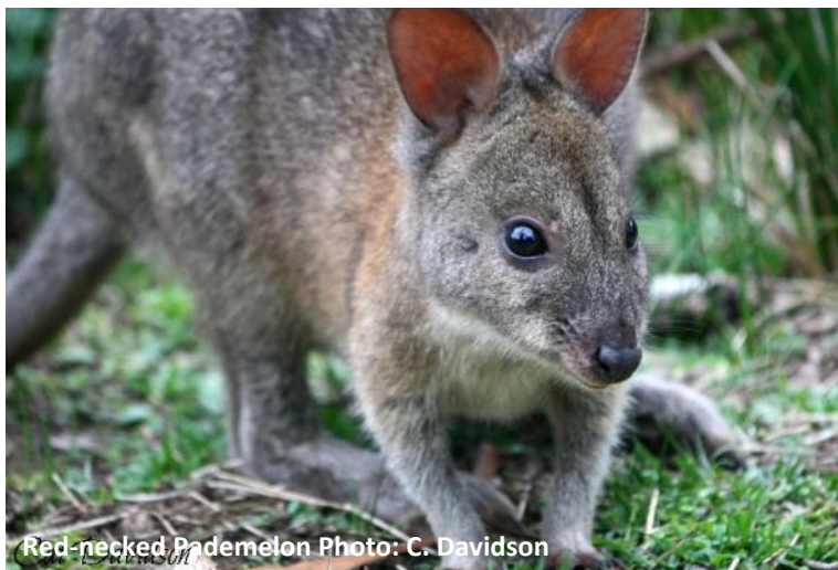
Red-necked Pademelon

Accommodation: O'Reilly's Rainforest Retreat (en suite rooms). Meals included: B, L, D.