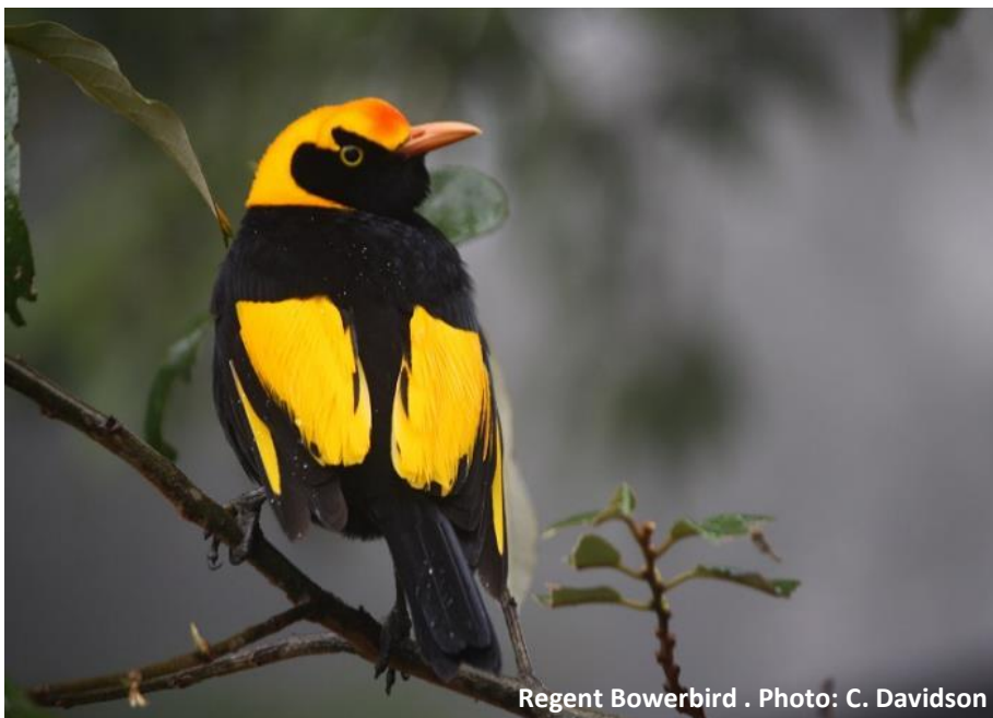
Regent Bowerbird . Photo: C. Davidson

Day 2. Thursday 24 November 2022. Brisbane to Lamington National Park. This morning we will make our way from the city of Brisbane to Lamington National Park (around 2 hours' drive), which contains the largest tract of subtropical rainforest in Australia, including large stands of magnificent Antarctic Beech Nothofagus (Lophozonia) moorei that defines Australia's connection with Gondwana. This 212km 2 UNESCO World Heritage site is extremely biologically diverse, with over 60 reptiles and 30 amphibians and a rich assemblage of birds and mammals. We will spend the day walking around the tracks close to our accommodation which are full of birds and reptiles during the day. Reptile species we should see today include Southern Angle-headed Dragons, Scute-snouted Skinks, Land Mulletts, Shade skinks, Water Skinks, Tyrone's Skink, Carpet Pythons and Rough-scale Snake. We should also see a huge variety of birds like Crimson Rosellas, King Parrots, Australian Logrunner, Red-browed Finch, Green Catbird, Paradise Riflebird Regent and Satin Bowerbirds. We will take a break in the late afternoon to watch the Red-necked Pademelons and Whiptail