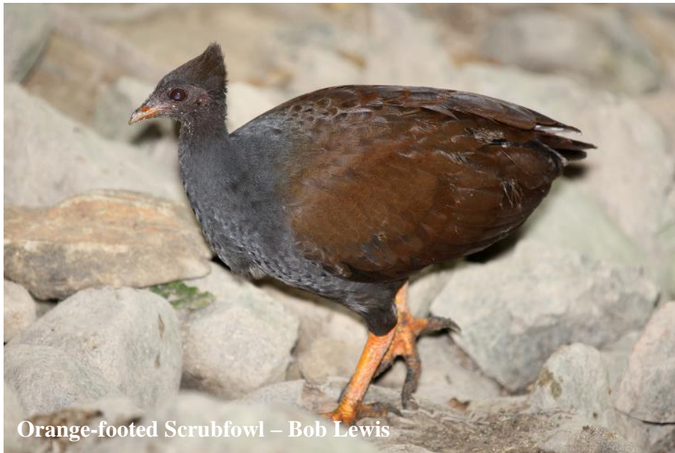
Orange-footed Scrubfowl