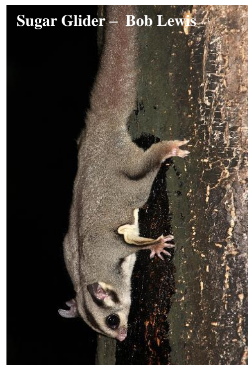
Sugar Glider