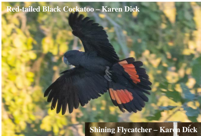
Red-tailed Black Cockatoo – Karen Dick

Accommodation: Daintree Village. (en suite cabins). Meals included: B,L,D.