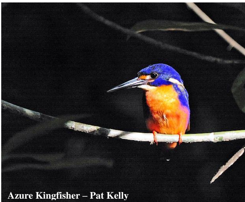
Azure Kingfisher – Pat Kelly

Accommodation: Cairns hotel (en suite rooms). Meals included: B,L,D.