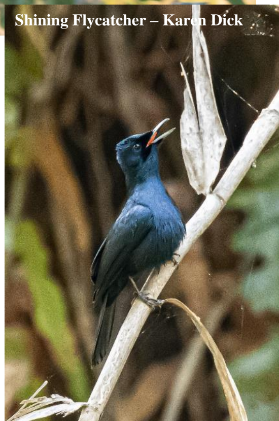
Shining Flycatcher – Karen Dick

Accommodation: Cairns hotel (en suite rooms). Meals included: B,L,D.