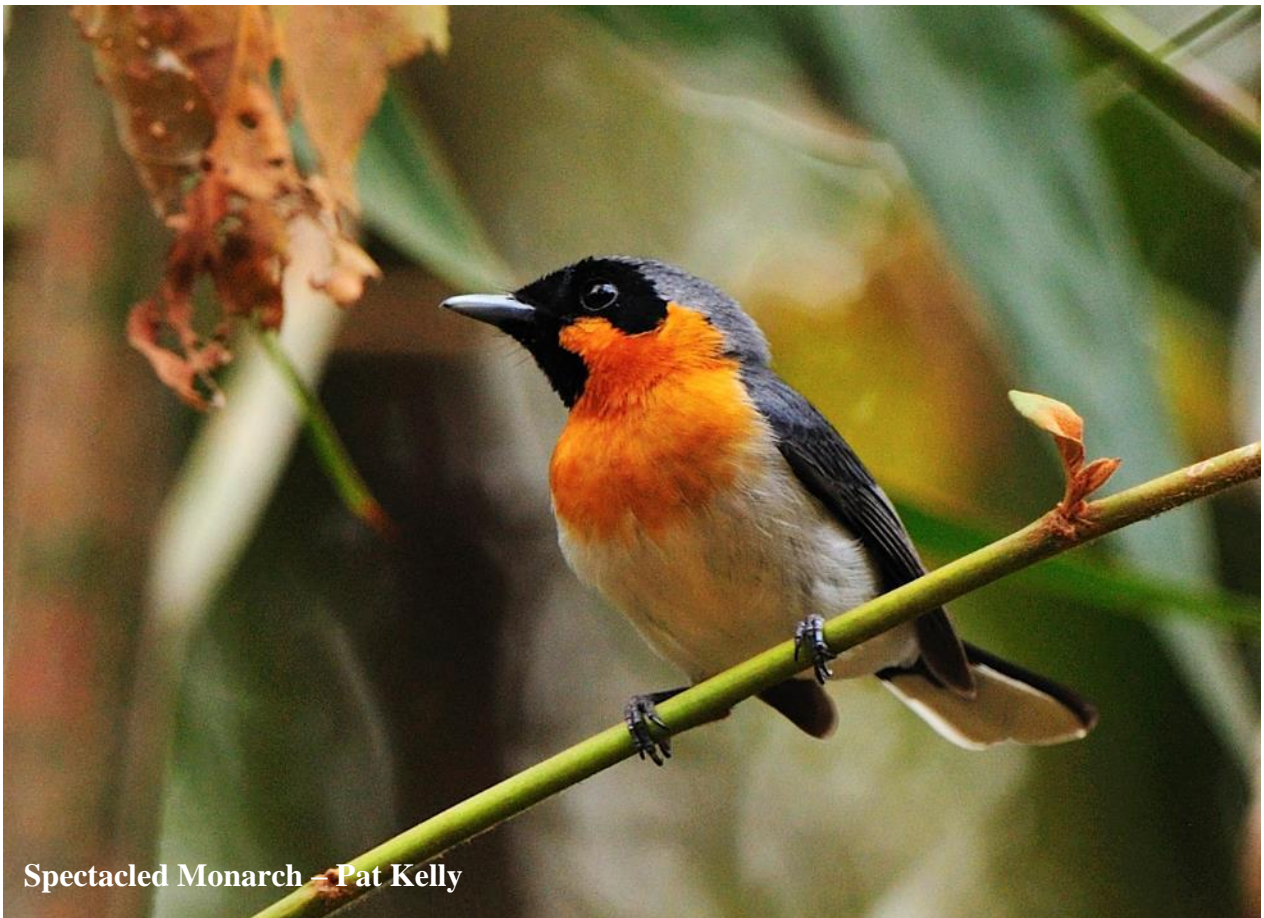
Spectacled Monarch - Pat Kelly