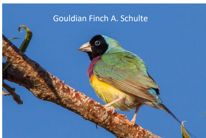
Gouldian Finch A. Schulte

Today we will leave the Gibb River Road and cut back to the main sealed road. We will visit Winjana Gorge, and the Tunnel Creek National Park. Birds here include more chances of Gouldian Finch and Crested (Northern) Shrike Tit, as well as Diamond Dove, Pictorella Mannikin, Star Finch and Red-winged Parrot. We will stay overnight tonight at the township of Fitzroy Crossing. Accommodation: Fitzroy Crossing (en suite rooms). Meals included: B (cooked) LD