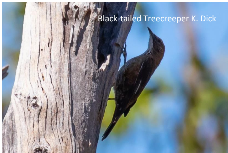
Black-tailed Treecreeper K. Dick

Around Drysdale Station we will look for the star attractions of the area - Purple-crowned Fairywren and Crested (Northern) Shrike-tit ( ssp whitei ). The fairywrens live in the pandanus-lined waterways where we can also see Azure Kingfisher, Buff-sided Robin, Crimson Finch, White-gaped & Rufous-throated Honeyeaters and Black Bittern. The shrike-tit is a likely future taxonomic split and is found in the tropical eucalypt woodlands on the station.