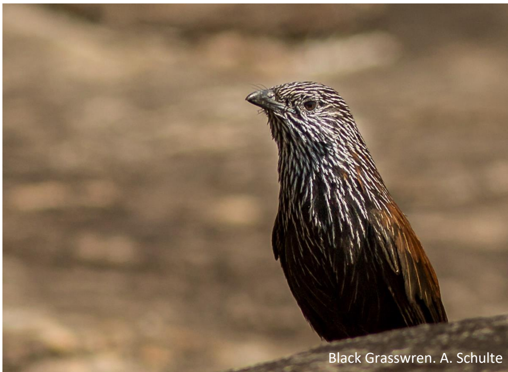
Black Grasswren. A. Schulte

This small group tour has been designed to follow on from our popular Top End to Eastern Kimberley tour and precede our Broome-Dampier Peninsula tour which allows for maximum flexibility in exploring this remote and little-explored area of Outback north-western Australia.