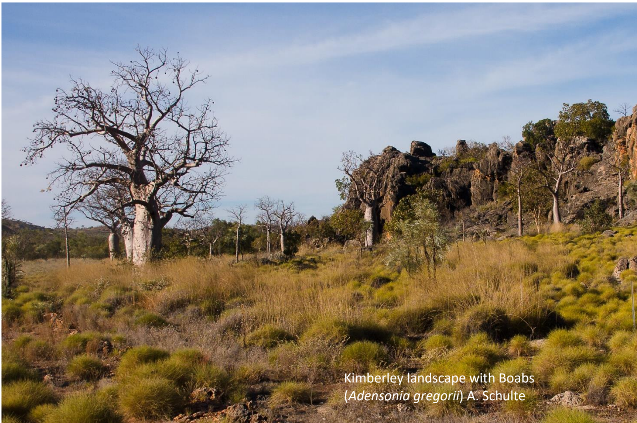
Kimberley landscape with Boabs ( Adansonia gregorii ) A. Schulte

Accommodation: Lodge on Mitchell Plateau (tented cabins) for 2 nights. Meals included: B (continental) LD each day.